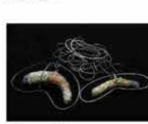
Myung Urso (NY) "Life" Series Necklace Sewn Silk & Sterling Silver