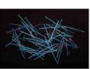
Unknown Artist (US) Necklace Anodized Aluminum & Wire