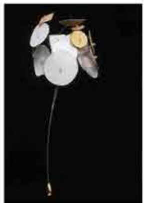
Hilde Janich (Germany) Stick Pin Paper, Acrylic, Wire, & Paint