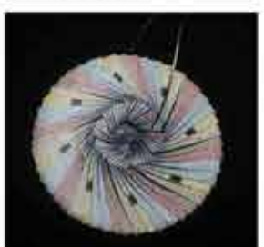
Nel Linsen (Netherlands) Paper Brooch/Pendant Paper & Elastic