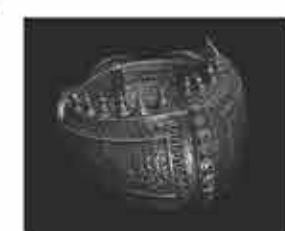
Unknown East Indian Artist (India) Silver Bracelet Silver & Wire