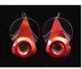
David LaPlantz (NM) Earrings Aluminum