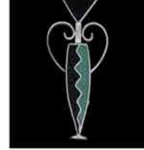
Claire Sanford (MA) Inlaid Pin Silver & Inlaid Resin