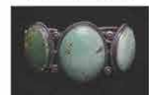
DC Earrings Silver, Enamel, and Copper