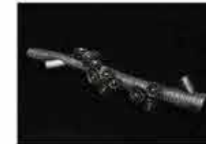
Judith Kinghorn (MN) Lichen Brooch Oxidized Sterling Silver & Gold