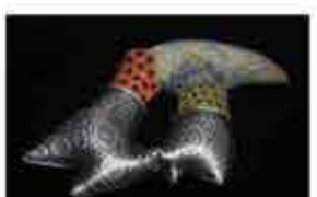
Ford & Forlano (PA & NM) Hydro Top Pin Polymer & Silver