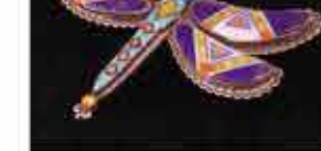
Dragonfly Brooch Coral, Sterling Silver, Sugilite & Turquoise