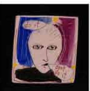
F. Dagg (US) "Do it, Don't Do it" Pin Ceramic