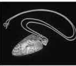
Shellie Brooks Pendant Polymer, Silver, Roller Printed & Silver Snake Chain