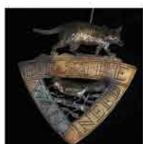
Unknown Artist (US) Beast Sterling silver