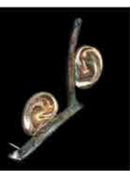
Nancy Worden (WA) Brooch with Ears Sterling Silver & Gold Plate