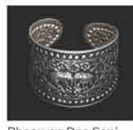
Bhagwan Das Soni (India) Elephant Cuff Sterling Silver