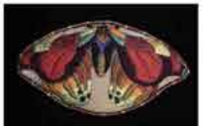
Theodora Elston (CA) Moth 14 Embroidered Thread, Beads, Metal Pin & Moth