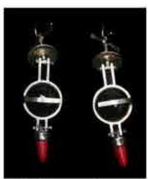
Heinz Brummel (MN) Earrings Oxidized Silver, Resin, Onyx, Silver & Gold Ear Wire