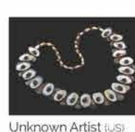
Unknown Artist (US) Necklace Olive, Turquoise & Limpets