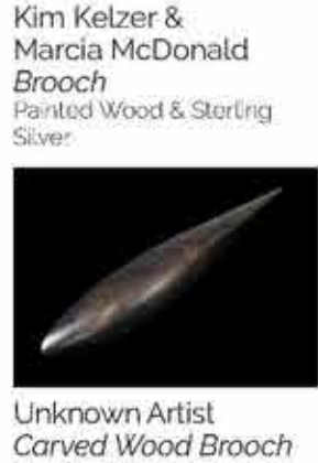
Unknown Artist Carved Wood Brooch Tropical Wood