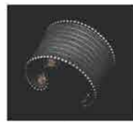
Dharmendra Soni (India) Granulated Cuff Sterling Silver, Fabricated & Pattern Wire