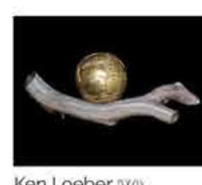
Ken Loeber (WI) Brooch 18K Gold & Fossilized Coral