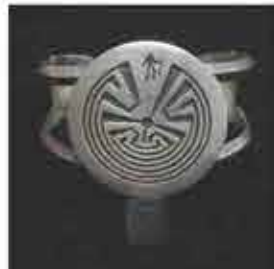
GUL (US) Man in the Maze Bracelet Silver 8" x 23"