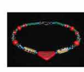
Rita Okrent (CA) Assembled Necklace African Glass Trade Beads