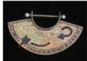
Unknown Artist Brooch Silver, Copper, Pearls & Map of Yugoslavia