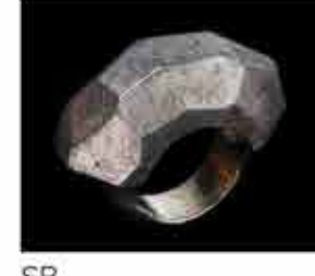
SB Silver Ring Silver