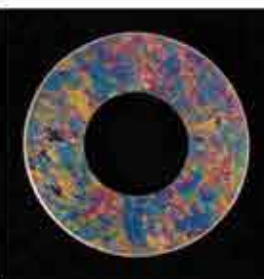
David Watkins (United Kingdom) Brooch Resin, Anodized Titanium & Silver