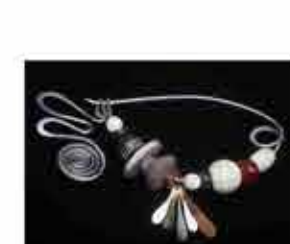
Ramona Solberg (WA) Fibula Silver, African Trade & Ostrich Shell Beads & Terracotta Spindle Whorls