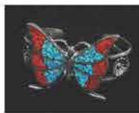
Unknown Artist Antique Bracelet Sterling Silver, Coral & Turquoise