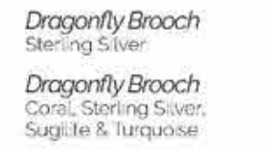
Dragonfly Brooch Sterling Silver