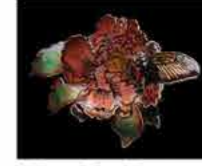
Hsiang-Ting Yen (NC) Flower Brooch Enamel, Copper, Gold Plating & Green Gemstone