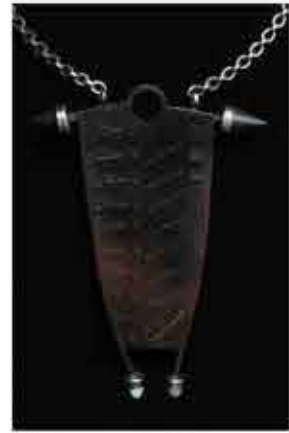
Unknown Artist (North America) Pendant Steel, Silver, Turquoise, Onyx & Silver Chain