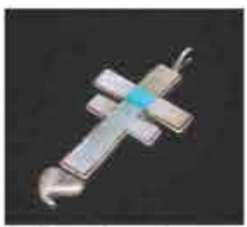
Anthony Lovato (Santo Domingo Pueblo, NM) Cross Pendant Sterling Silver, Mother-of-Pearl & Turquoise