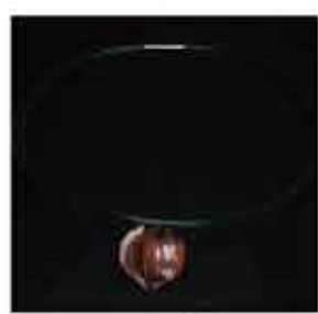
Unknown Artist Seedpod Torque Copper Pendant & Steel Wire