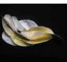
Reiko Ishiyama (NY) Brooch Sterling Silver & Vermell