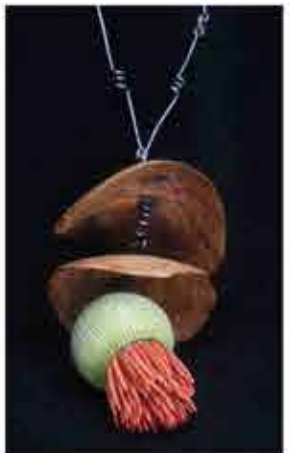
Kathleen Dustin (NH) "Pods and Plants" series Necklace Polymer, Wood & Sterling Silver