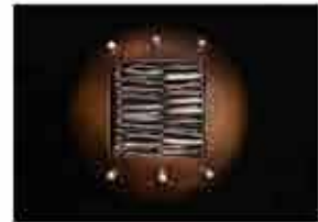
Biba Schutz (NY) Brooch Copper & Silver Wire