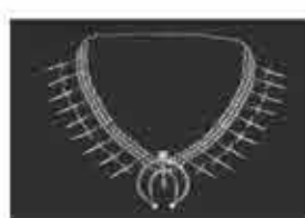
Unknown Navajo Artist Naja Pendant Silver