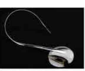
Svatopluk Kasaly (Czech Republic) Neckpiece Rhodium Plated Brass & Lapidary Worked Glass