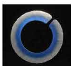
Coen Mulder (Netherlands) Bracelet Anodized & Forged Aluminum