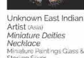
Unknown East Indian Artist (Asia) Miniature Deities Necklace Miniature Paintings Glass & Sterling Silver