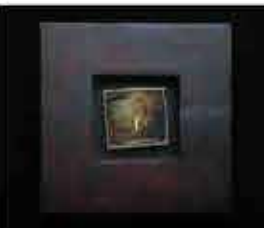
Patricia Telesco (FL) Square Pin IX #3 14k and 18k Gold, Nickel & Bronze & Wooden Box