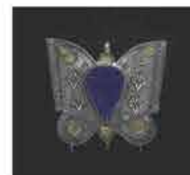
Unknown Afghani Artist (Afghanistan) Butterfly Pendant Silver, Lapis Lazuli & Wire