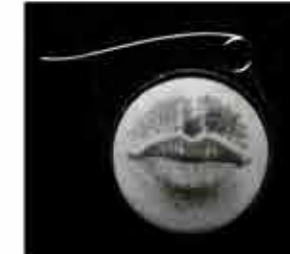
Jessica Calderwood (IN) Masculine Fem Enamel, Silver & Steel Wire